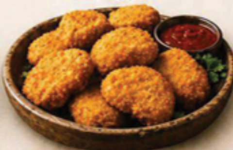
Chicken Nuggets (8 Pcs) ₹ 190