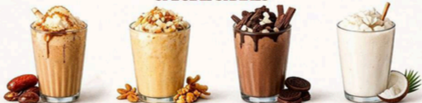
Malabar Cream Crush (Sharjah) ₹ 130 Royal Nut Elixir (Dry Fruits) ₹ 170 Choco Crunch Bliss (Dreo / KitKat) ₹ 150 Coastal Coconut Silk (Tender Coconut) ₹ 150