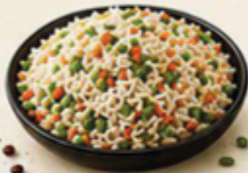
Veg Fried Rice