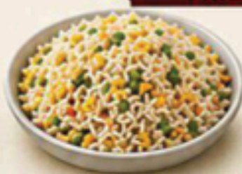
Egg Fried Rice