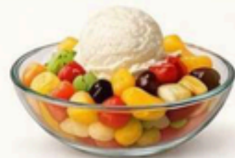
Fruit Salad & Ice Cream ₹ 140