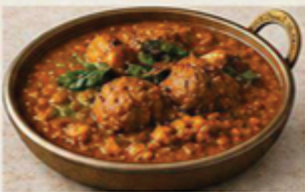
Kerala Chicken Curry