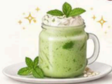
★ Courtyard Magic Mint ★ Signature muish mājrit ₹ 170