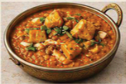
Paneer Tikka Masala