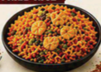
Schezwan Chicken Fried Rice