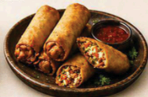
Veg Spring Roll (6 Pcs) ₹ 160