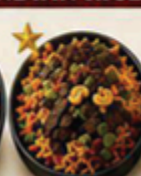
Nathile Beef Biryani