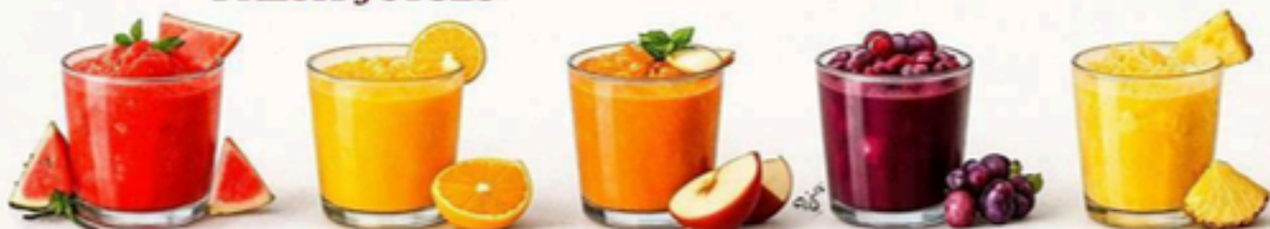
Watermelon Juice ₹ 80 Musambi / Orange Juice ₹ 120 Apple Juice ₹ 140 Grape Juice ₹ 100 Pineapple Juice ₹ 100