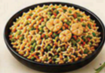
Mixed Fried Rice