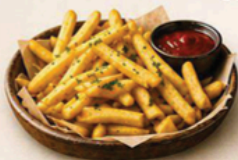
Normal French Fries ₹ 150