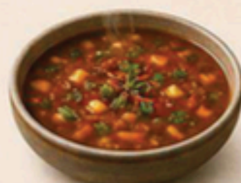
Hot and Sour (Veg / Non-Veg) ₹ 130 / ₹ 160