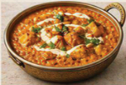
Paneer Butter Masala