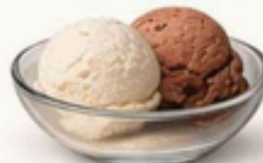
Ice Cream (Double) ₹ 120