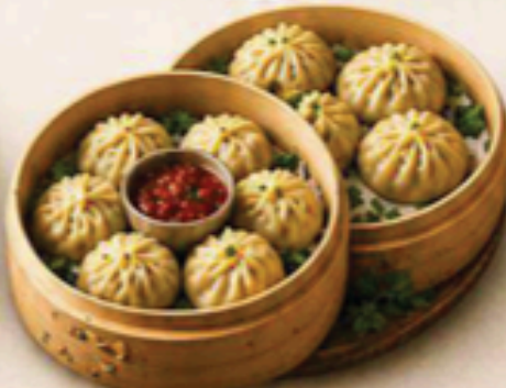
Chicken Momos (Steamed / Fried) ₹ 190 / ₹ 210