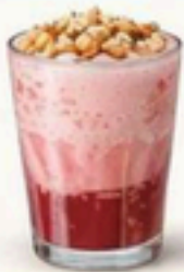
Classic Falooda ₹ 180