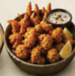
Golden Fried Prawns