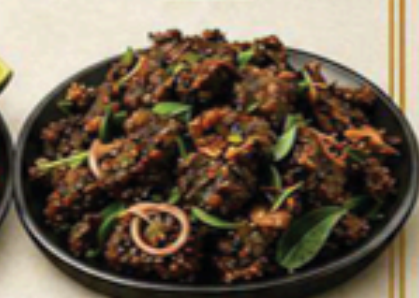
Beef Dry Fry