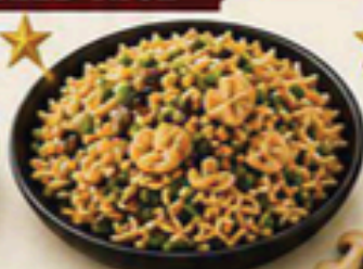
Mushroom Fried Rice