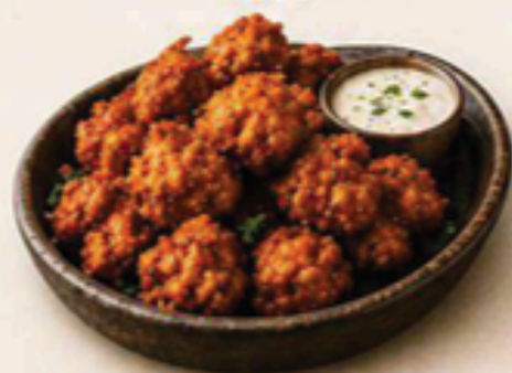
Chicken Pops (14 Pcs) ₹ 170