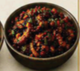
Dry Chinese Prawns