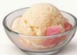
Ice Cream (Single) ₹ 60