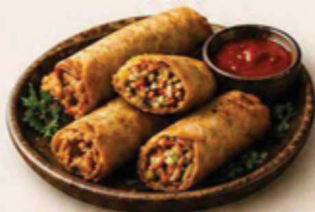
Chicken Spring Roll (6 Pcs) ₹ 180