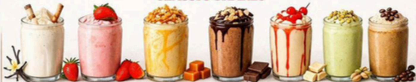
Classic Milk Paradise (Vanilla) ₹ 130 Berry Velvet Dream (Strawberry) ₹ 140 Golden Caramel Swirl (Butterscotch) ₹ 140 Dark Cocoa Indulgence (Chocolate) ₹ 140 Spanish Cream Fantasy (Spanish Delight) ₹ 150 Pistachio Royale (Pista) ₹ 150 Mocha Frost Blend (Cold Coffee) ₹ 150