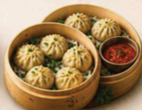
Veg Momos (Steamed / Fried) ₹ 140 / ₹ 150