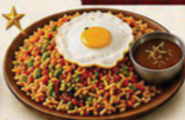
Beijing Triple Fried Rice