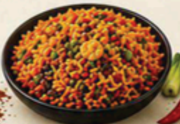
Schezwan Mixed Fried Rice