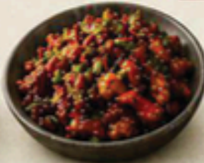
Chilli Fish Dry