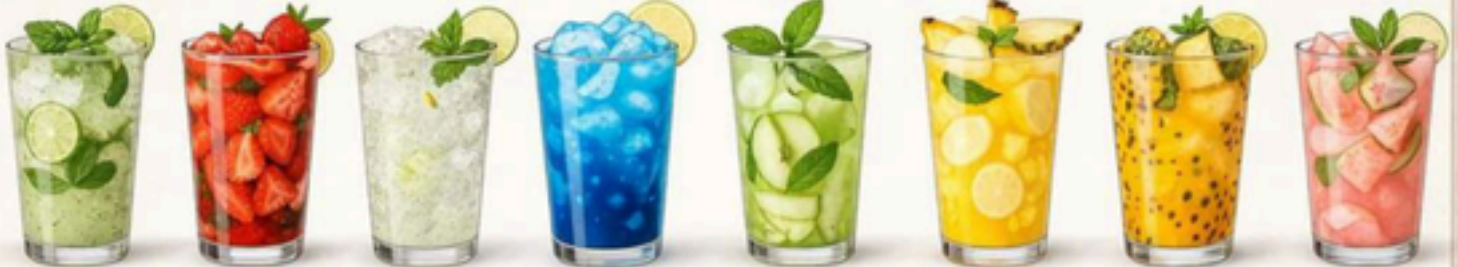
Classic Mint Mojito ₹ 150