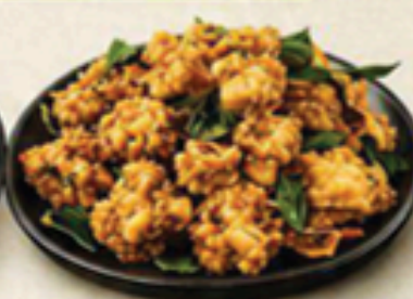
Thai Crispy Chicken