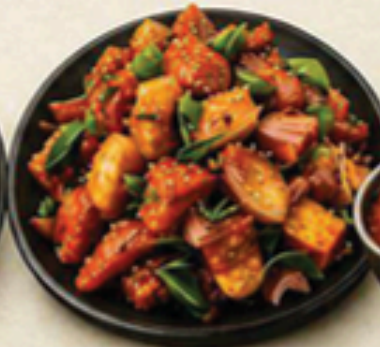
Chilli Baby Corn Dry