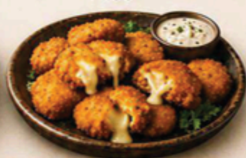
Chicken Cheese Nuggets (8 Pcs) ₹ 210