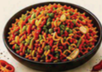
Schezwan Veg Fried Rice