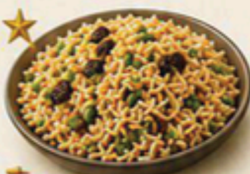
Chicken Shanghai Fried Rice