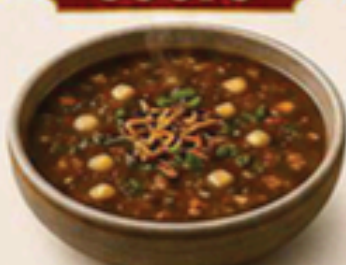
Hot Manchow (Veg / Chicken) ₹ 130 / ₹ 160