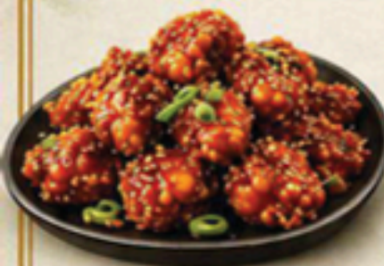
Korean Fried Chicken