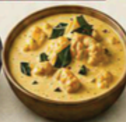
Vembanad Paal Konj