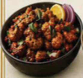
Kerala Prawns Roast