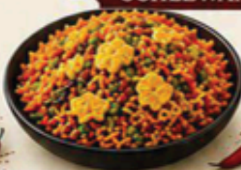
Schezwan Egg Fried Rice