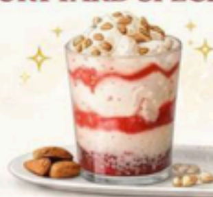
★ Royal Falooda ★ Courtyard Special ★ ₹ 240