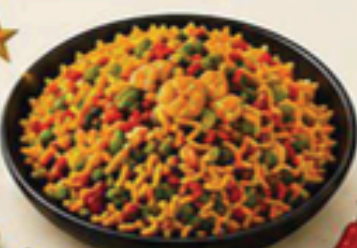
Singapore Chicken Fried Rice