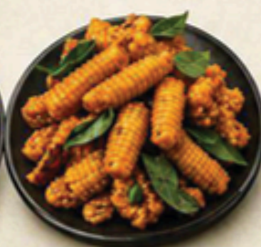
Baby Corn 65