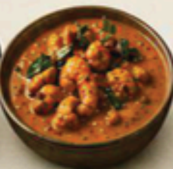
Malabar Prawns Curry