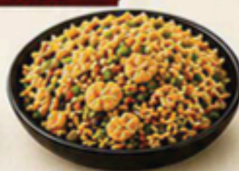
Chicken Fried Rice