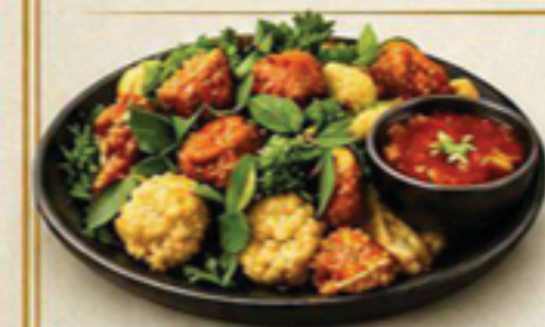
Crispy Fried Veg