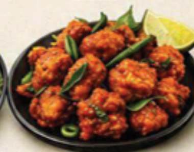
Chicken 65 (H / F)