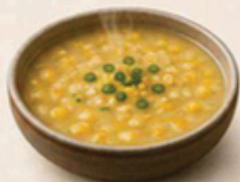
Sweet Corn (Veg / Chicken) ₹ 130 / ₹ 160