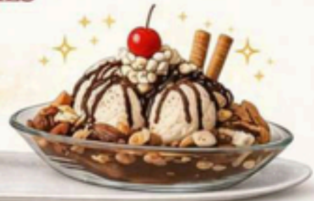
★ Nanus Special Sundae ★ ★ Courtyard Special ★ ₹ 320