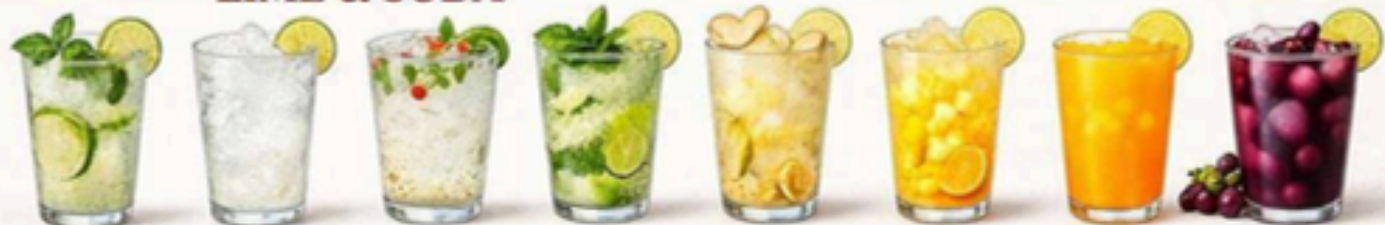
Fresh Lime ₹ 50 Lime Soda ₹ 40 Chilly Soda ₹ 60 Mint Lime ₹ 60 Ginger Lime ₹ 60 Pineapple Lime ₹ 70 Orange Lime ₹ 70 Grape Lime ₹ 70