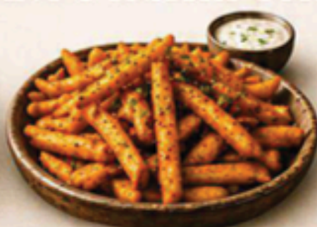
Peri Peri Fries ₹ 165