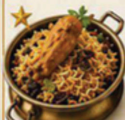
Nanus Dum Biryani