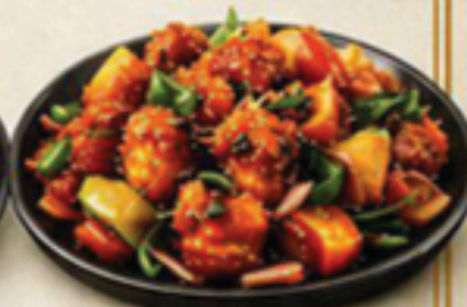
Chicken Honey Chilli