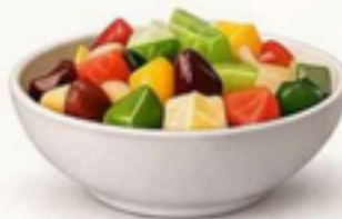
Cut Fruits Fresh seasonal fruit selection